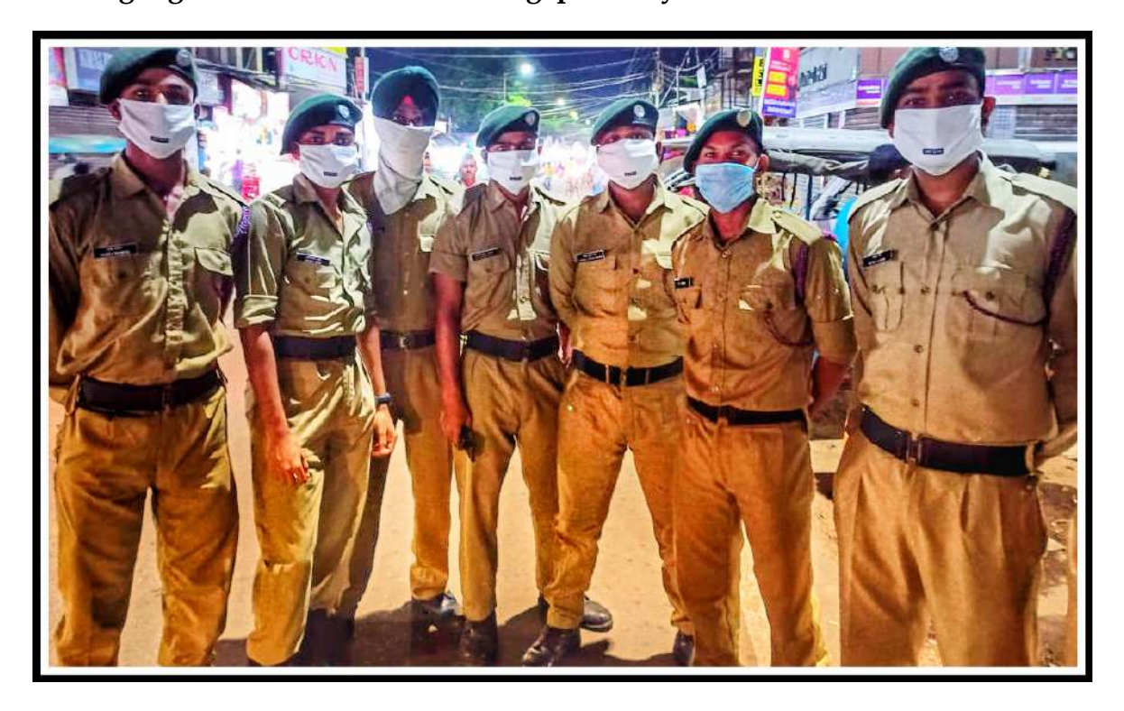
Cadets of Durgapur Government College at the time of traffic control duty.