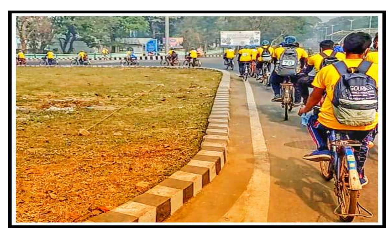
Cadets rallying on bicycle during the awareness program.

Ride as much or as little, as long or as short as you feel, but ride. Cadets of Durgapur Government College took part in a cycling rally on 13.12.2020 to spread the awareness among the people on all social distancing norms and COVID-19 precautions to stop the spread of Corona Virus pandemic. The rally started from DMA Club to Nachan Dam (Via A-Zone and B-Zone of Durgapur city).