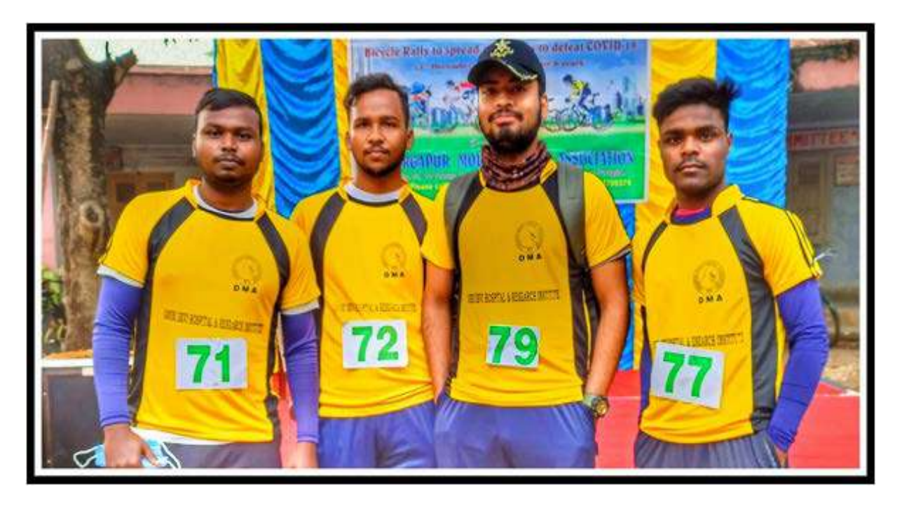
Cadets of Durgapur Government College at the event of cycle rally.