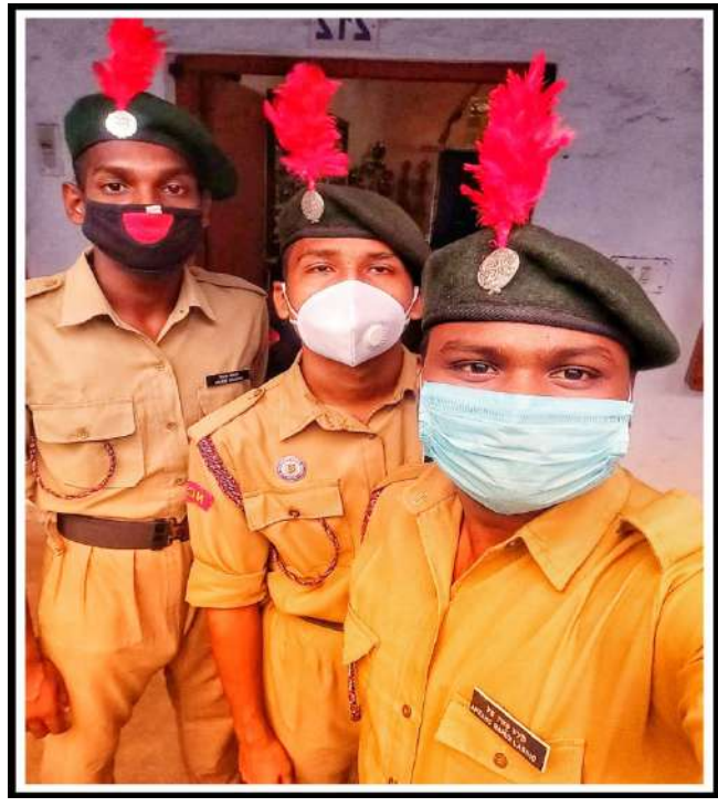
Cadets of Durgapur Government College on the occasion of NCC Raising Day celebration.