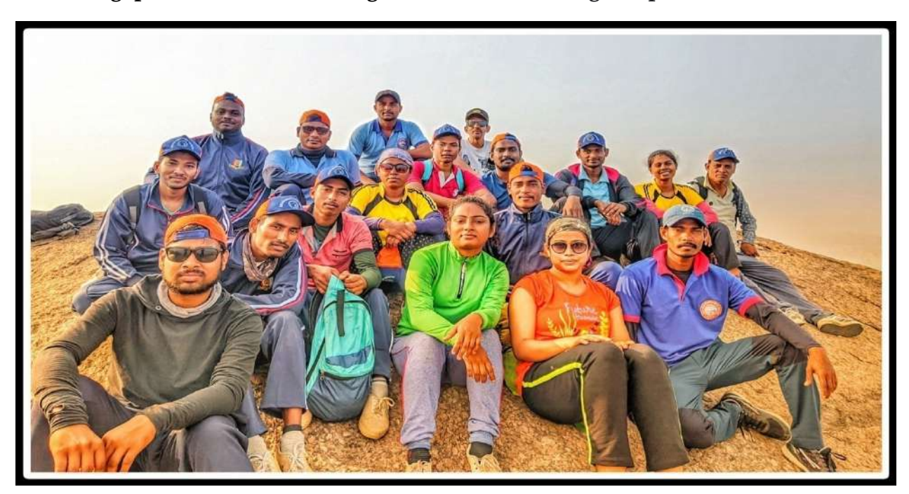
Cadets of our college after reaching the summit during rock climbing at Bero Hills.