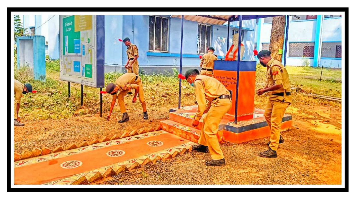
Cadets involved in campus cleaning.

As per the direction received form 10 Bengal Battalion NCC, Asansol, our respected CTO Dr. Sandip Majumder motivated the NCC cadets of the College to undertake the maintenance and cleaning program of statues and sculptures of the college as well as the campus itself on 03.12.2020. A total of 10 Cadets participated in the program.