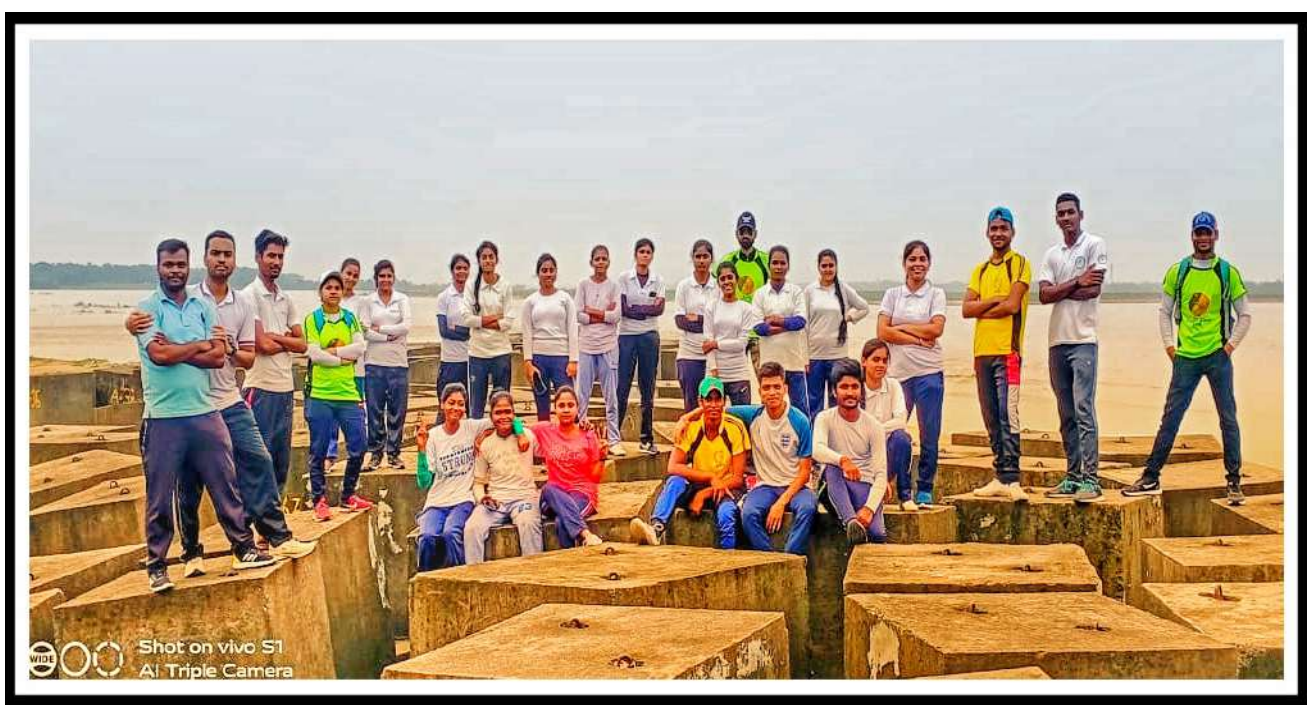
Cadets of Durgapur Government College during the event of cycle rally.