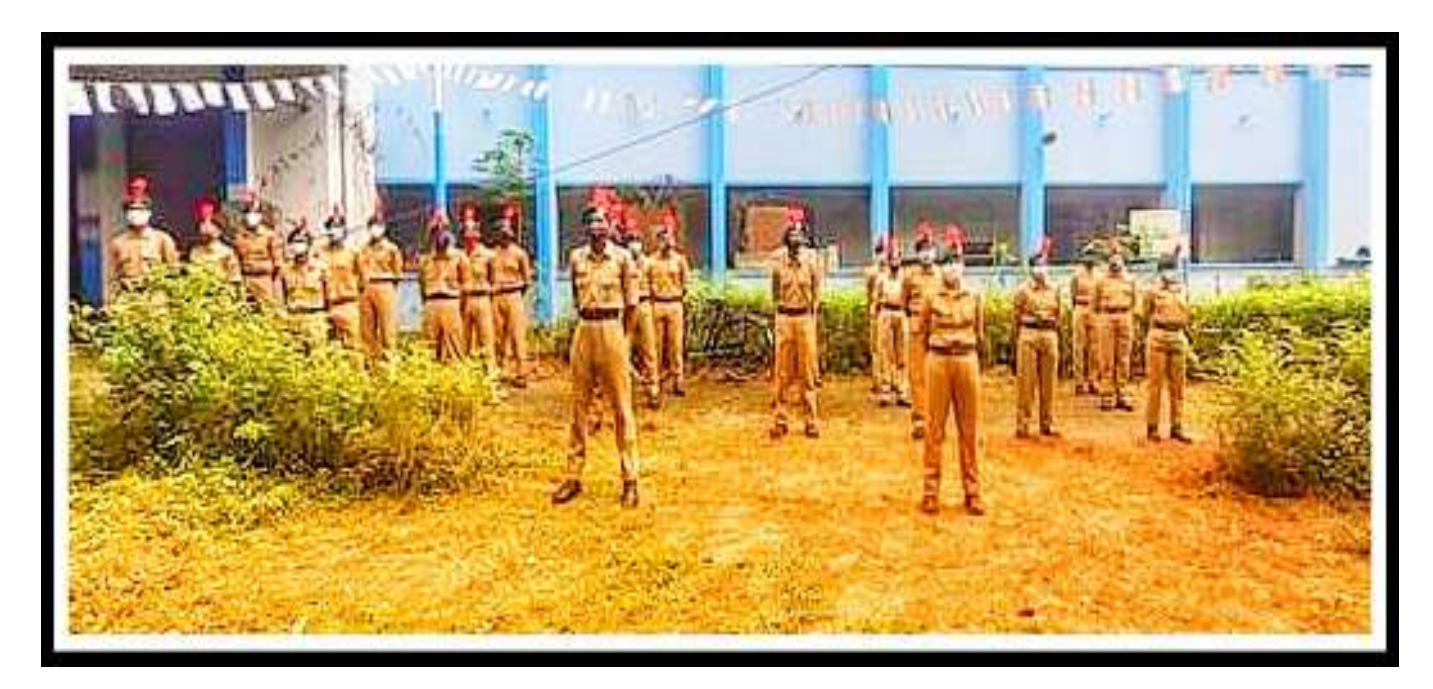
NCC Cadets standing maintaining physical distance at the time of flag hoisting ceremony.