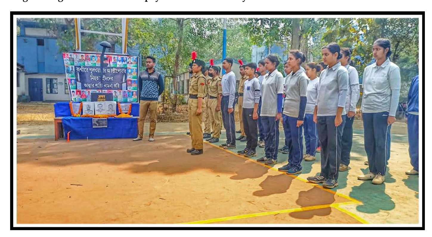
Cadets paying tribute to the martyrs of Pulwama attack.