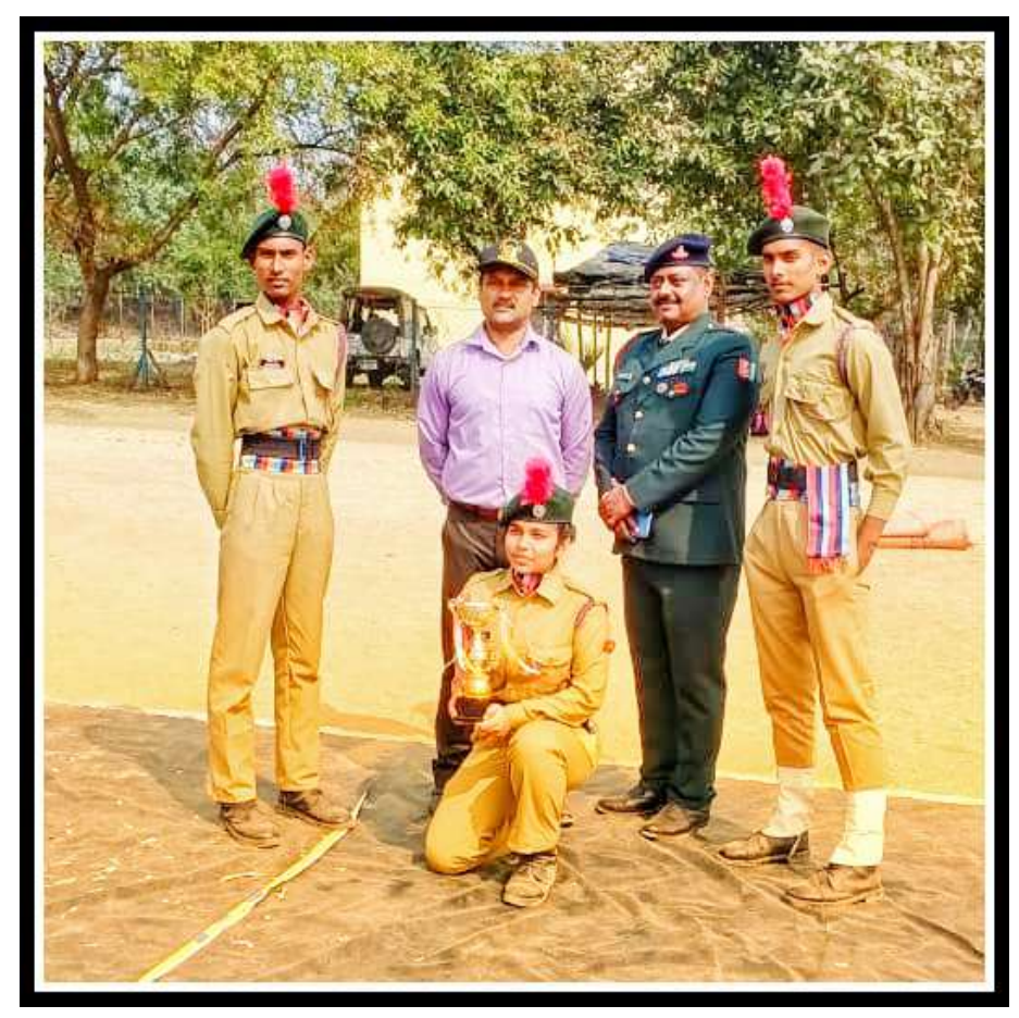
Our cadets with the Commanding officer and ADM officer of 10 Bengal Bn NCC on the occasion of Republic Day Parade.

On the prestigious occasion of 26<sup>th</sup> January, three cadets of Durgapur Government College were selected to participate in the Republic Day Parade, organized by the SDM office, Asansol.