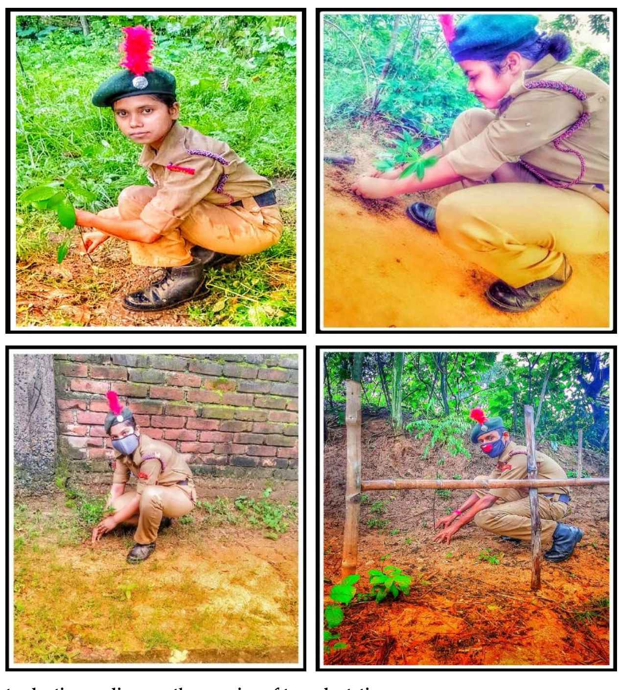
Cadets planting saplings on the occasion of tree plantation program.

Monsoon is the best time for tree plantation. As per the direction received form 10 Bengal Battalion NCC, Asansol, our respected CTO Dr. Sandip Majumder motivated the NCC cadets of Durgapur Government College to undertake tree plantation individually or in small groups observing all social distancing norms and COVID-19 precautions. Cadets planted saplings and sent photographs to the email id of NCC unit of college. A total of only 55 SD and SW cadets participated in the program.