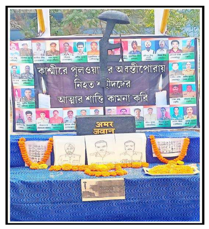
Stage arranged for the event to pay tribute to the martyrs.

On 14.02.2021 Durgapur Government College NCC unit paid their tribute to 40 CRPF soldiers who were martyred at the Pulwama attack in 2019. A total of 30 SD and SW cadets participated in the event. They followed social distancing norms and COVID-19 precautions to stop the spread of Corona Virus pandemic.