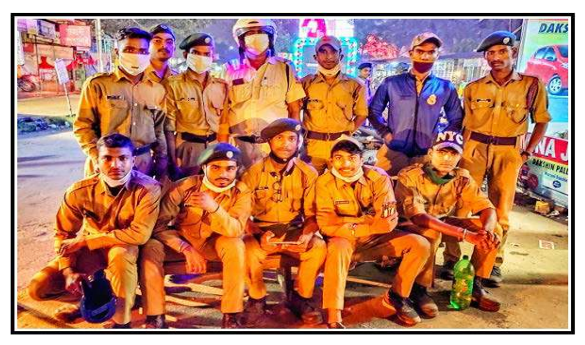
Cadets resting together for a moment in the gap of duty of traffic control.

NCC cadets of Durgapur Government College took part in the traffic control duty along with traffic police of West Bengal on the days of Durga Puja. The cadets have been provided with light sticks, helmets, megaphones and whistles. They patrolled and inspect various points in order to run the traffic properly and ensured smooth flow of human traffic from one gilded pandal to another during this COVID-19 pandemic. Some former NCC cadets also volunteered on the occasion. A total of 50 SD cadets participated in this duty.