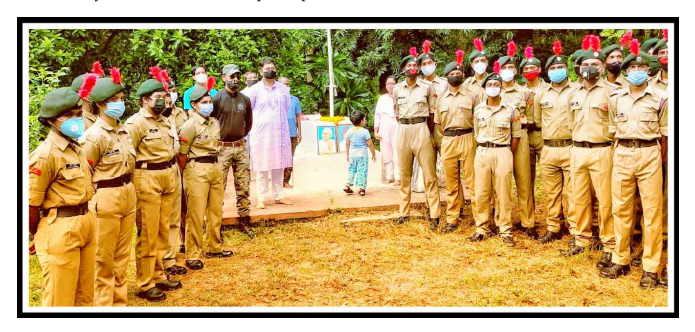
NCC Cadets and faculties of the college standing together after the flag hoisting ceremony.

In spite of the COVID-19 pandemic, on the prestigious occasion of 15<sup>th</sup> August, the NCC cadets of Durgapur Government College Celebrated the 74<sup>th</sup> Independence Day. All cadets wore mask and maintained physical distancing in the College campus in order to follow the guidelines to combat the community spread due to Corona Virus Pandemic. Due to this COVID-19 pandemic situation, a total of only 55 SD and SW cadets participated in the celebration.