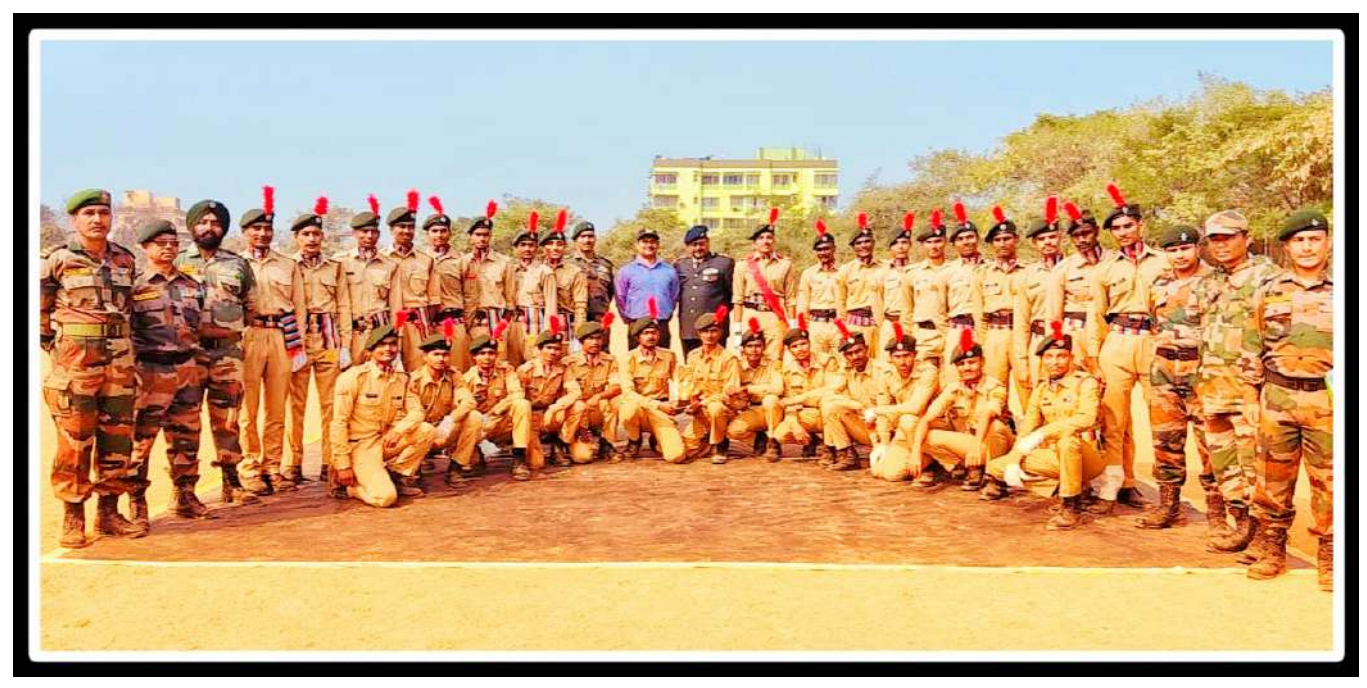
Cadets and PI staffs with the Commanding officer and ADM officer of 10 Bengal Bn NCC.