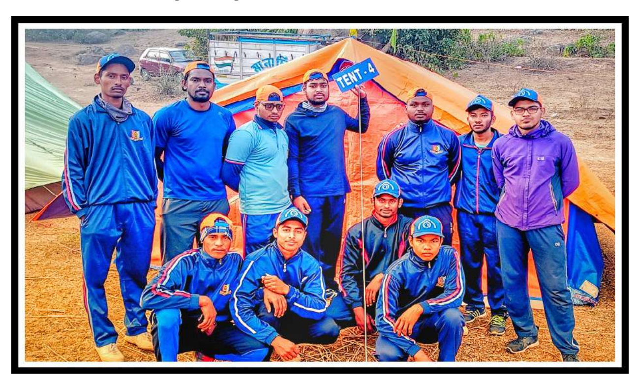
Cadets of Durgapur Government College at the rock climbing camp at Purulia.

Rock climbing is an activity where participants climb up, down or across natural rocks or artificial rock walls to reach the summit or the endpoint of a route without falling. A total of 15 cadets of Durgapur Government College participated in the rock climbing camp form 06.01.2021 to 11.01.2021 organized by Durgapur Mountaineering Association at Bero Hills , Purulia for basic and advance mountaineering training.